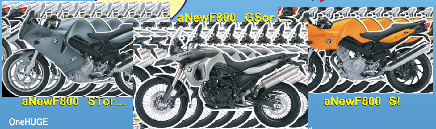
a New F800 ST or...

from Bob's BMW 10720 Guilford Rd • Columbia-Jessup, MD