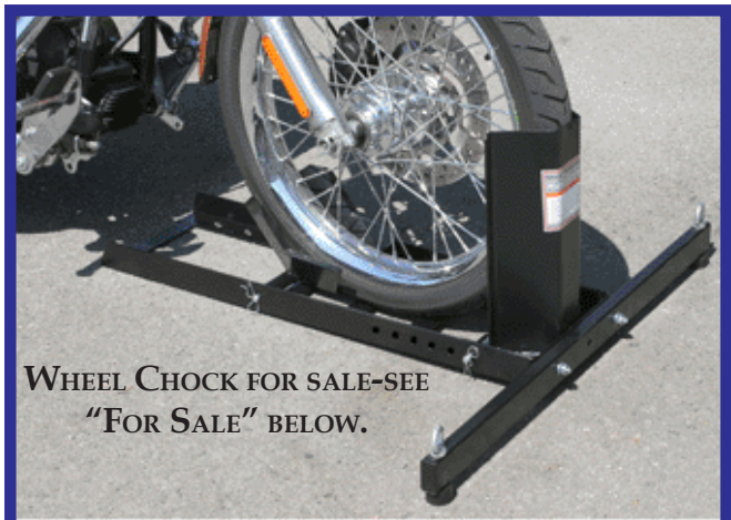
WHEEL CHOCK FOR SALE-SEE "FOR SALE" BELOW.