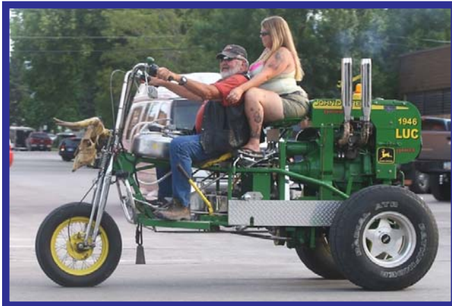
THE JOHN DEERE TRIKE