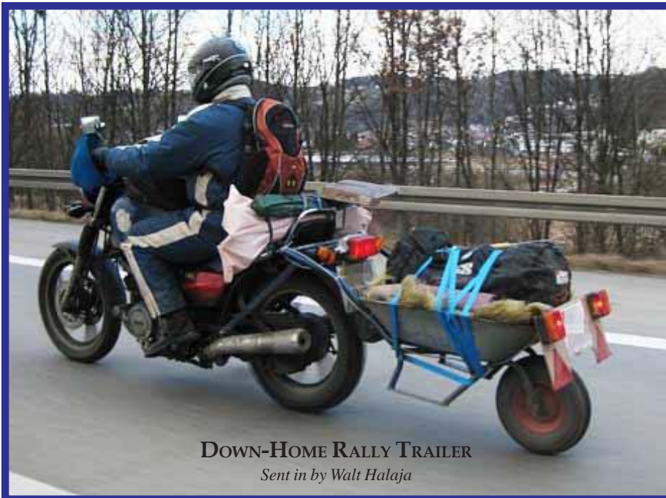
DOWN-HOME RALLY TRAILER