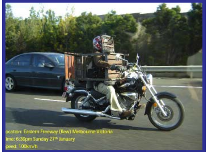
Location: Eastern Freeway (Kew) Melbourne Victoria Time: 6:30pm Sunday 27 th January Speed: 100km/h